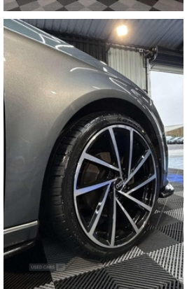
Audi A3 2.0tdi Se 150

own this Mint Audi A3 for as little as £38 per week. To apply for a personal finance quote click link below. Just follow these 3 simple steps